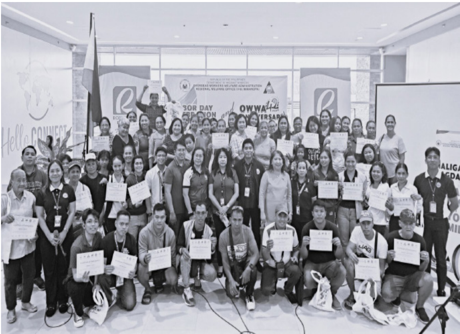
Participants of the “Handa Ka Na Bang Mag-abroad” Education Program for OFWs and Emigrants display their Certificates of Participation as they pose for a souvenir photo with the DFA-OWWA-DMW-DTI-TESDA-CityPESO Team on 2 May 2024 at Robinsons Place Palawan

In celebration of the 122nd Philippine Labor Day and the 42nd Anniversary of the Overseas Workers Welfare Administration (OWWA), the Department of Foreign Affairs - Consular Office (CO) Puerto Princesa in collaboration with its partner agencies, namely, the Overseas Workers Welfare Administration (OWWA), the Department